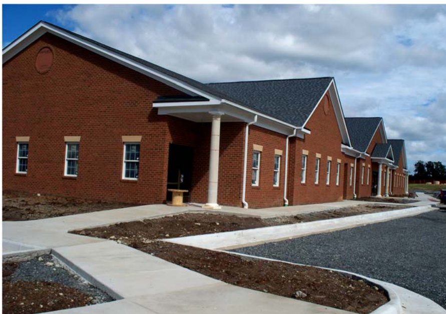
Medical Arts Building in Carmel Church

“Walmart and Blackwood expressed appreciation for the welcoming and professional attitude of the Caroline County Board of Supervisors, Economic Development office, and Planning Department.”